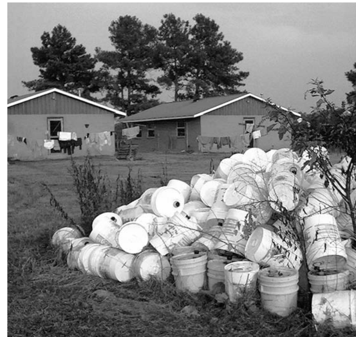
Pesticide containers dumped next to farmworker housing in Wake County.

This is especially hazardous for families with children, because workers can bring pesticide residues home on their clothing, shoes and hair, making children's exposure part of the occupational hazard. For many who live in sub-standard housing, regular indoor pesticide applications can compound the risk. Data from the Centers for Disease Control show that Mexican-Americans have higher levels of pesticide residue in their blood than other ethnic groups in the United States. (cont'd- final panel)