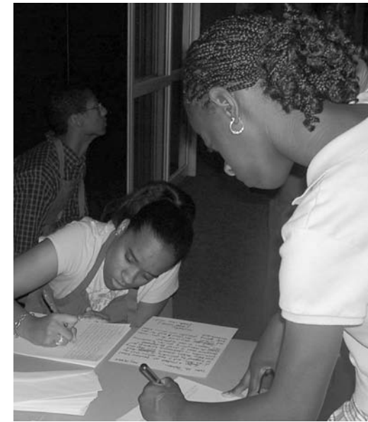
Youth Partners at Durham's Museum of Life and Science write school officials regarding pesticide reduction in Durham Public Schools.

Across North Carolina, parents, students and teachers are organizing to reduce pesticide use in their schools. They are working with school administration and staff to develop pest control programs that rely on pest prevention, rather than pesticide application.